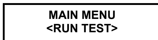
Figure 4. Main Menu

All Auto-Ohm operations begin at the MAIN MENU, which appears after the initial boot-up (after configuration and software revision data display briefly.) The Main Menu display is shown below: